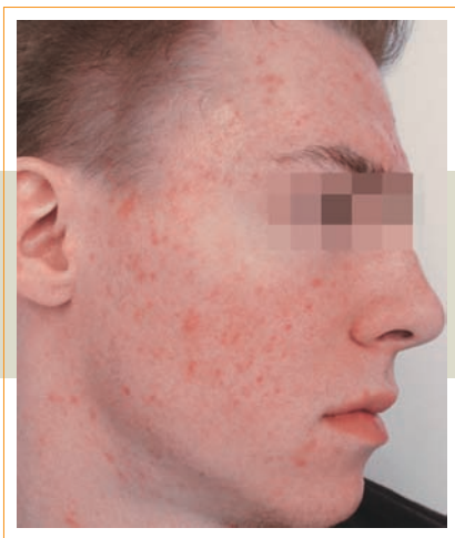
After 3 weeks