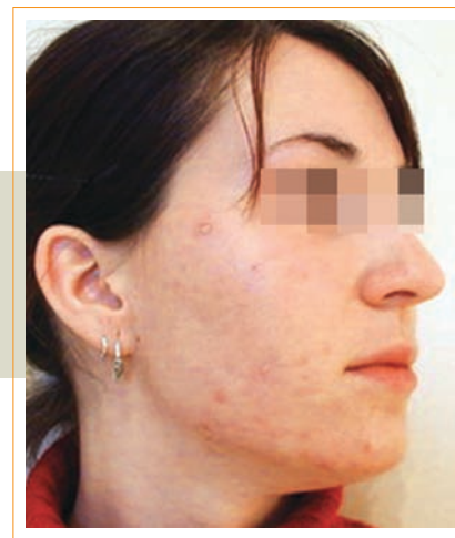
After 4 weeks